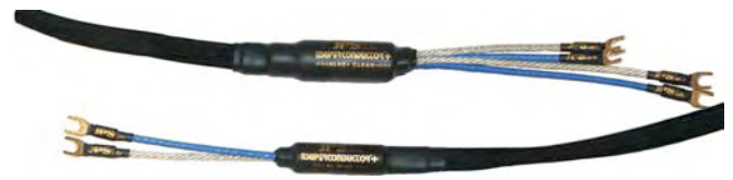
NEW!!! ALUMINATA SPEAKER AND INTERCONNECT CABLES