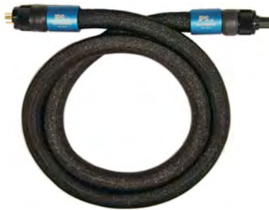
ALUMINATA AC CABLE