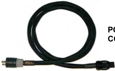
POWER AC+ CORD