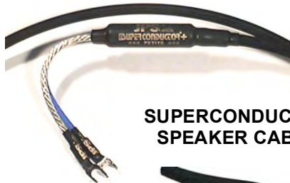
SUPERCONDUCTOR+ SPEAKER CABLES