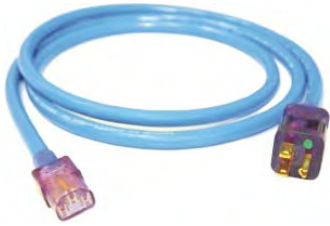
GPA 2 AC CORD