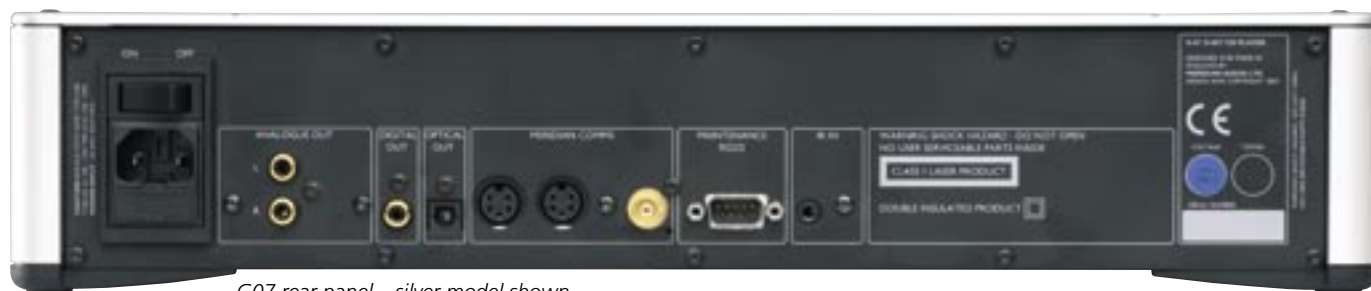
G07 rear panel – silver model shown