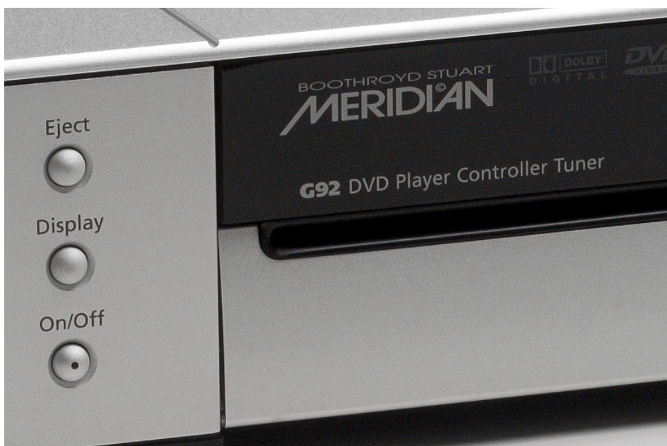
G92 features a slot-loading DVD-ROM drive

The HDMI output can be connected to a DVI input if the device supports HDCP copy protection, using a suitable adaptor cable.