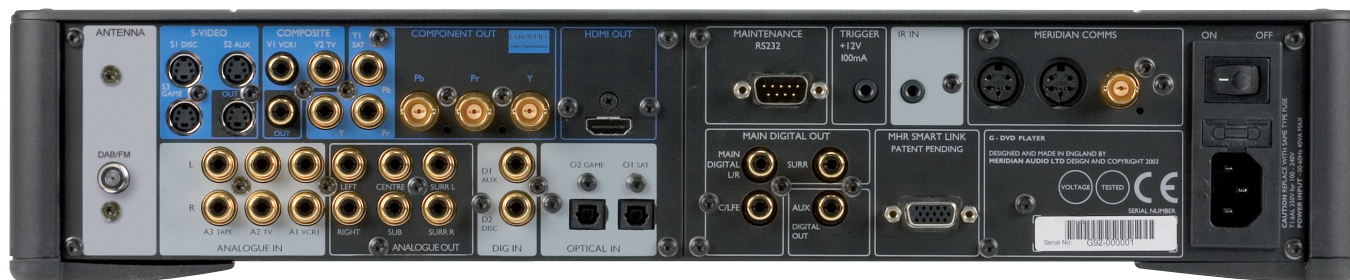
G92 DAB rear panel

In addition, the G92 incorporates digital surround decoding to allow the multichannel analogue and digital outputs to be used to drive a 5.1 surround system directly, based on Meridian DSP Loudspeakers and/or conventional analogue amps and speakers.