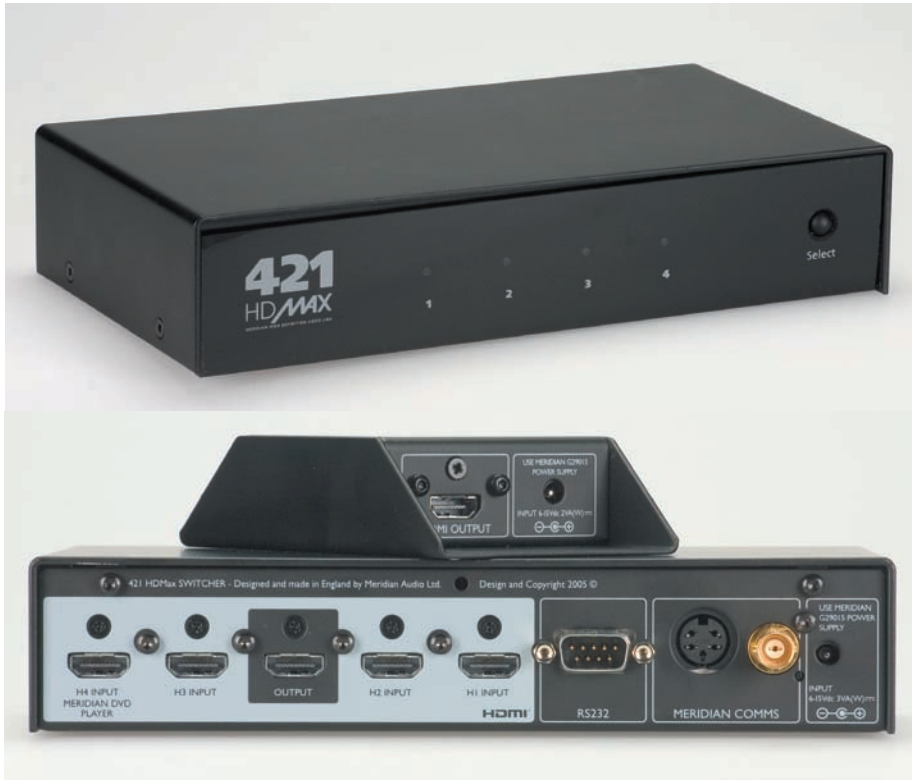
HDMAX 421 Switch (top) and 121 Extender (right). Above: rear panels showing connections. Not to the same scale.

The 421 Switch is a four input, one output HDMI switching unit with extremely wide bandwidth and employing proprietary technology to switch high-resolution digital HDMI video and audio. Each input also includes Meridian's HDMI Extender technology to improve image quality and stability and reduce noise and jitter on both short and long cable runs.