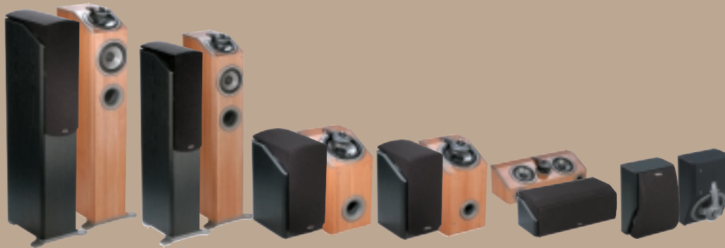
Images not to scale