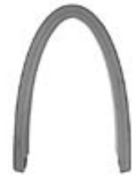
first MDF/aluminum cabinet