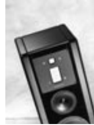
first 2-way ribbon system