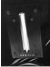
first PIEGA ribbon tweeter