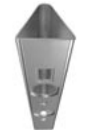
first extruded aluminum cabinet