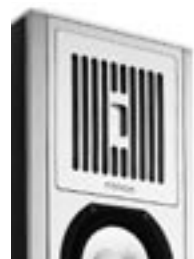
first coaxial ribbon system