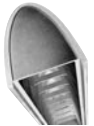
first sand cast aluminum cabinet