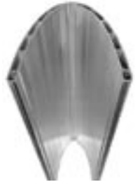
first extruded aluminum sandwich cabinet