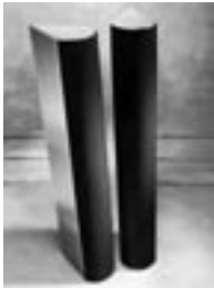
first steel/MDF cabinet