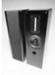
first series piano cabinet