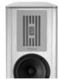
first small coaxial ribbon system