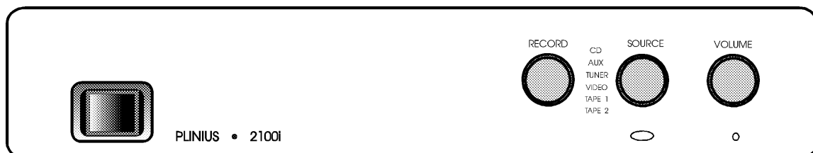
FRONT PANEL LAYOUT SHOWING CONTROLS

The Remote Control will operate in two modes. If the Volume Up/Down button is depressed momentarily the volume will increase/decrease in very small increments. This allows fine adjustment to listening levels. If the Volume Up/Down button is depressed continuously, the volume will increase/decrease rapidly.