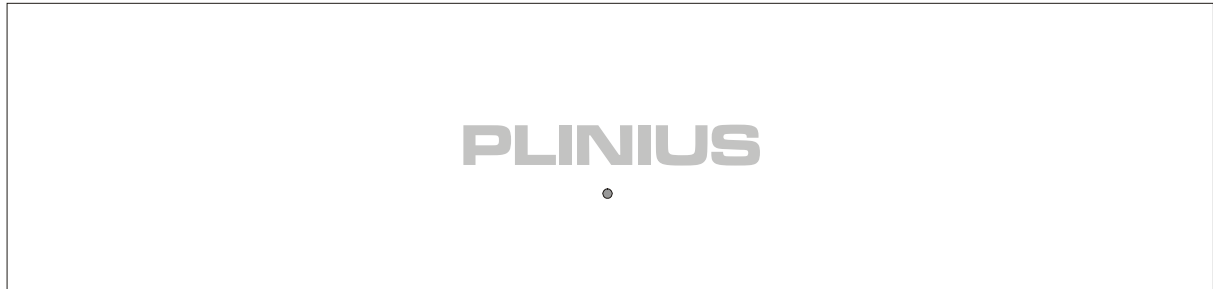
FRONT PANEL LAYOUT SHOWING DISPLAY LED